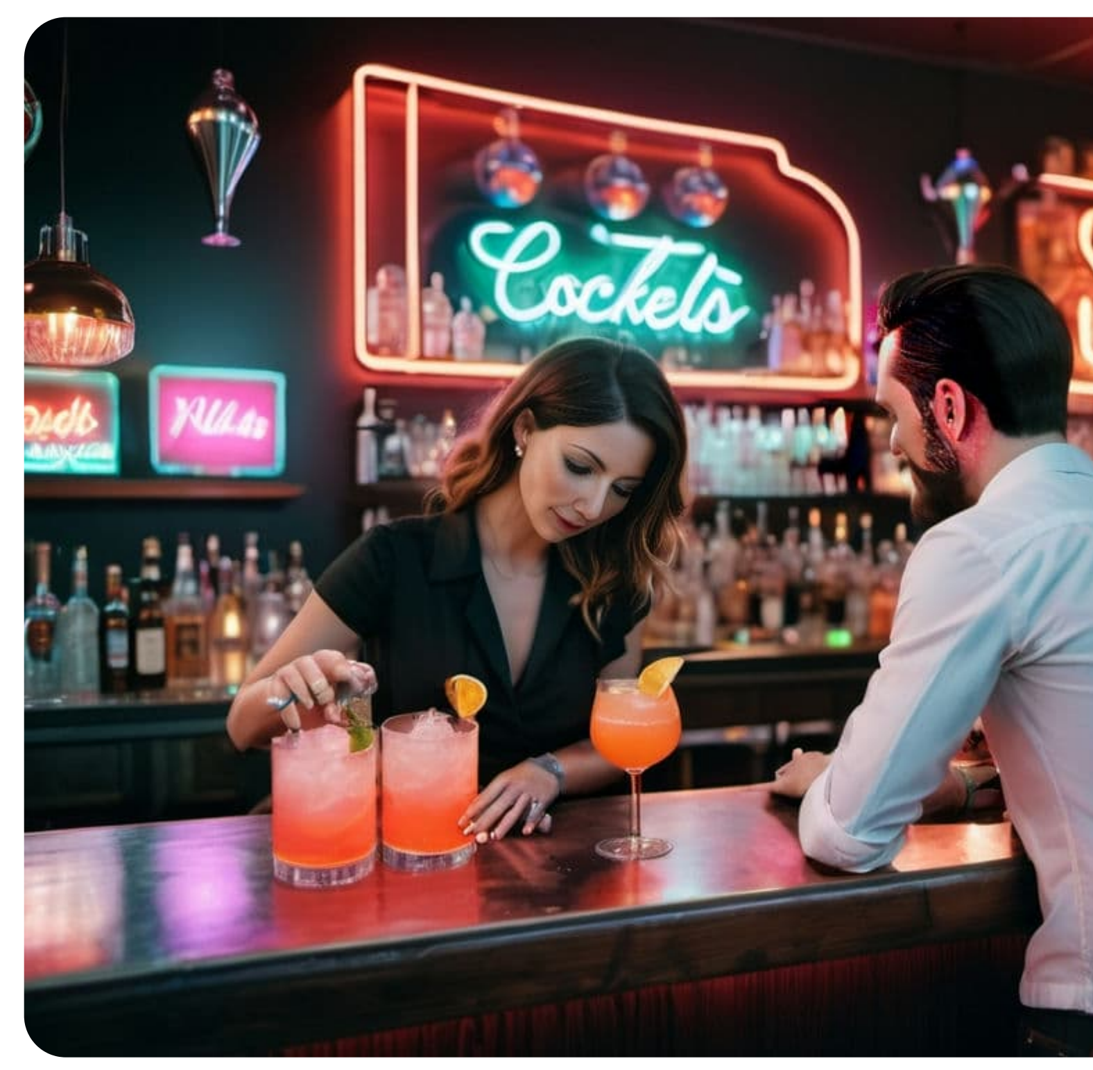
Reducing Carbon Footprint in Houston's Hospitality Industry