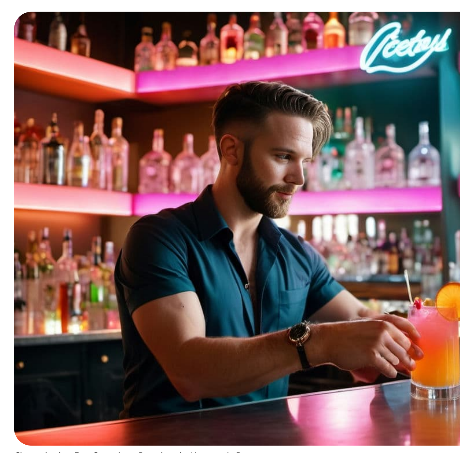
Championing Eco-Conscious Practices in Houston's Bars